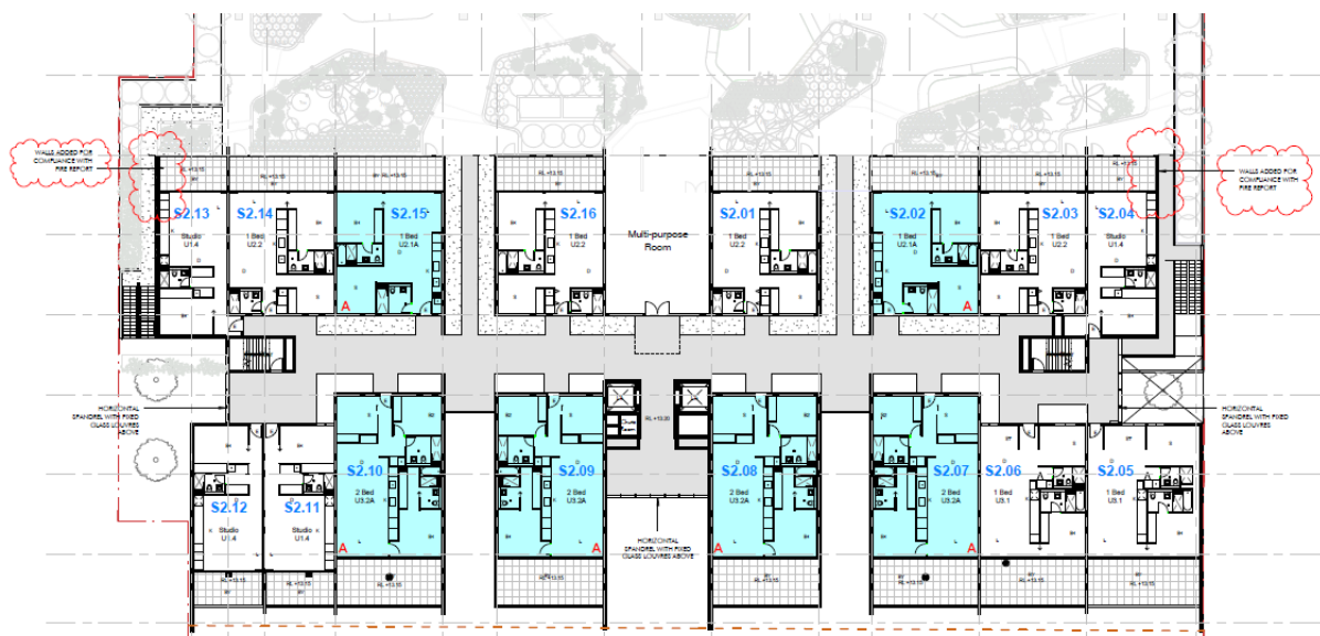
Figure 3. Example of balcony being extended on Level 2 Southern Building

Additionally the wall along the outer edge of the balconies in N2.05, N2.10, S2.04, S2.13, S3.04 and S3.13 have been extended to comply with the fire safety report provided with the application. This is supported.